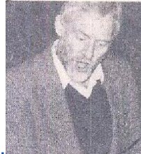
Harding & Noel).